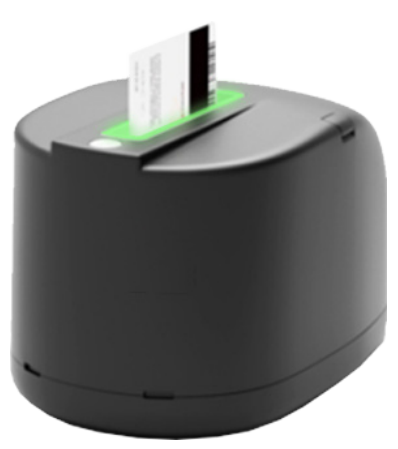
Driver's License Image Capture requires use of an ID Scanner device, sold separately. Contact your sales rep for more information.